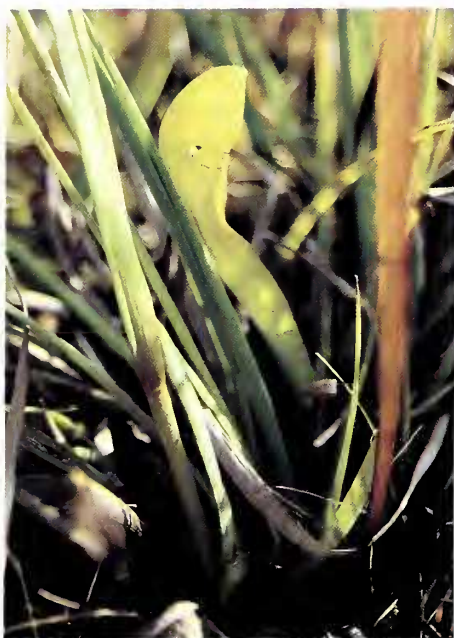
Figure 1. S. flava x S. psittacina . Wild material under cultivation. Green color predominates even in full sun.